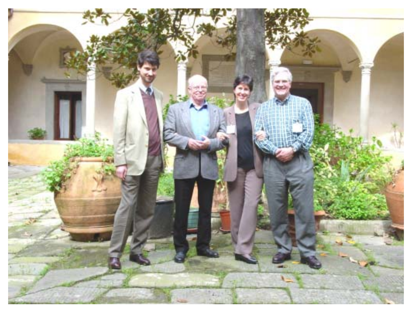
Keller Windup Fiesole 2001