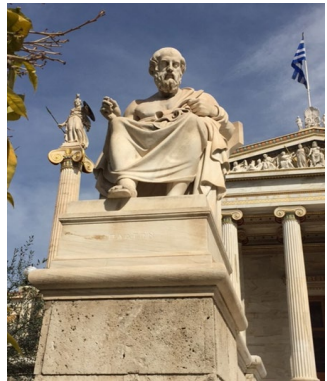
Plato (428-348 bc)