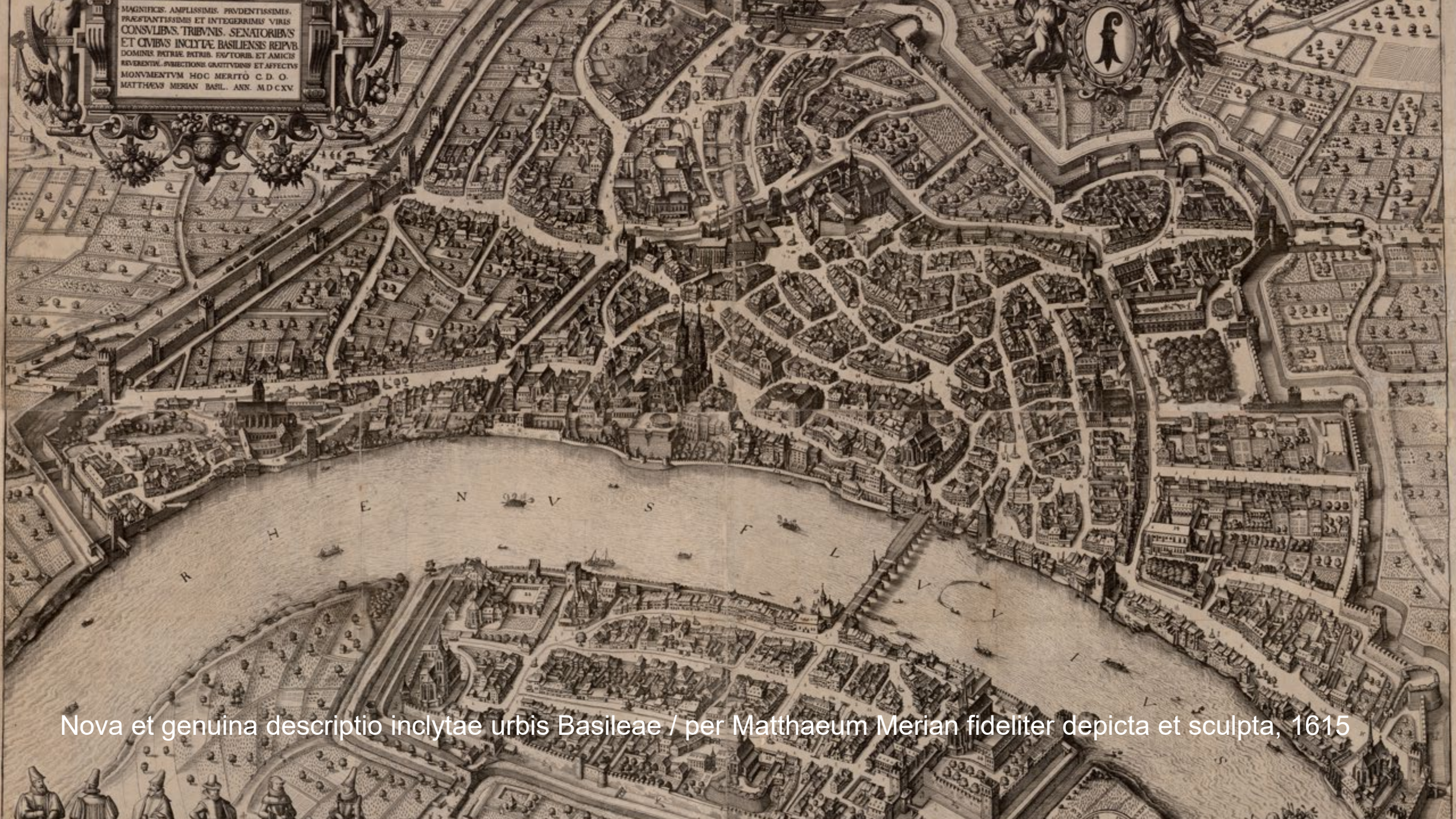
Nova et genuina descriptio inclytae urbis Basileae / per Matthaeum Merian fideliter depicta et sculpta, 1615