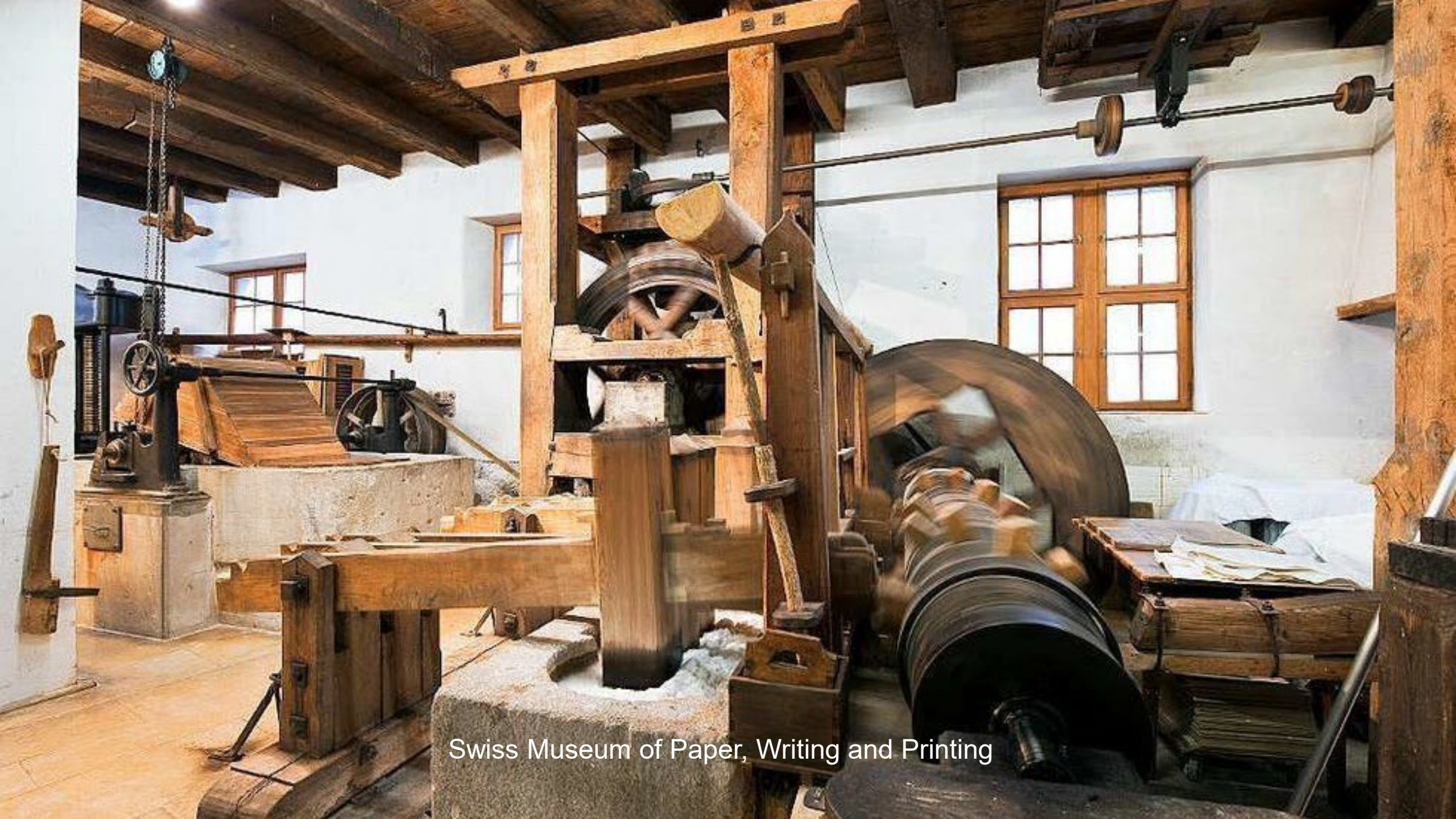
Swiss Museum of Paper, Writing and Printing