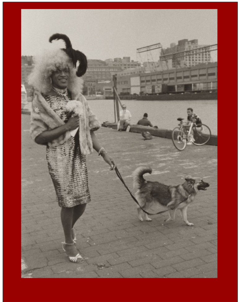
Activist Marsha P. Johnson walking a dog on West Side Piers, NY, NY